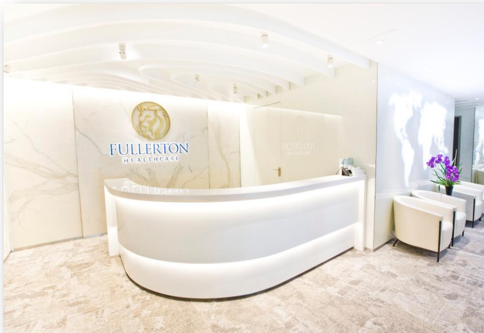
Ngee Ann City Level 26 Reception

10 Collyer Quay, #03-08 Ocean Financial Centre, Singapore 049315