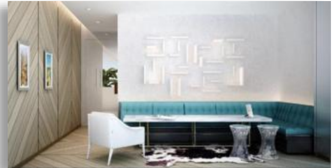
Ngee Ann City Level 26 VIP Lounge